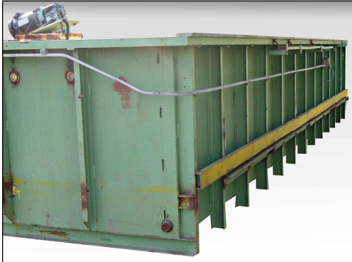
Ultrasonic tank in its original state

Princeton Junction, NJ - May, 2009 - MISTRAS Software and Systems announce the delivery of a five channel plate and billet scanner to Laboratory Testing Inc. (LTI), located in Hatfield, Pa.