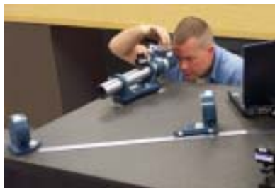
Calibration using an Autocollimator

Granite surface plates come in a wide-range of sizes and vary in color, density, porosity, stiffness and hardness, depending on their composition. Flatness and repeatability are the key measurements that define the accuracy of a surface plate. Flatness is the difference between the lowest and the highest points on the surface of the plate. Repeatability is determined by taking measurements across the entire surface to identify deviation in the plate's flatness. Federal specification GGG-P-463c states the guidelines for flatness and repeatability in the three standard grades of plates: Laboratory Grade AA, Inspection Grade A and Toolroom Grade B.