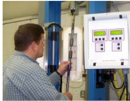
Stress rupture specimen to be tested

Also, stress rupture testing was added to our scope of Nadcap accreditation with the Performance Review Institute (PRI). Copies of our accreditation certificates are available at www.labtesting.com .