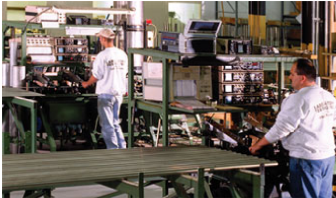
High-speed immersion ultrasonic inspection is an efficient method for detecting internal flaws in tubing and pipe.

Ensuring tubing quality depends in part on the tube producer's ability to locate and identify discontinuities. Weld inspection is performed to meet industry specifications or customer requirements and aims to identify products that do not meet acceptance criteria. The results of weld inspection are valuable to mills for monitoring their manufacturing process and determining which tubular products meet their quality requirements. This information also is valuable to consumers of tubular products who need to verify the quality of their materials to ensure the safety and performance of the products they manufacture.